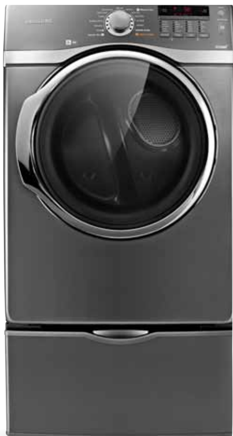
Shown with optional pedestal

7.4 cu. ft. Capacity Front Load Electric Woolmark Certified Dryer